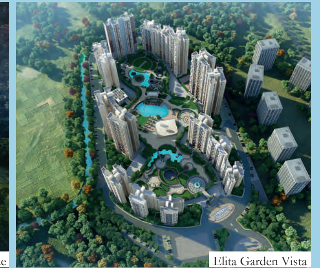
Elita Garden Vista