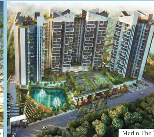
Merlin The 1