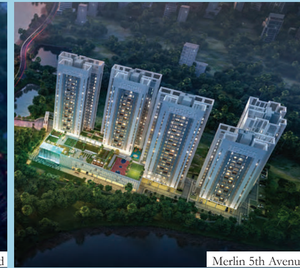
Merlin 5th Avenue