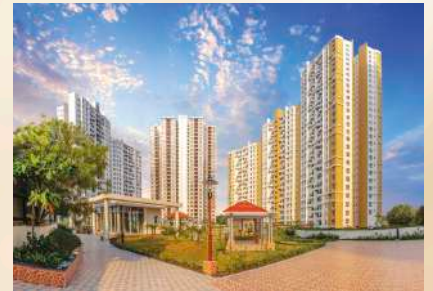
Elita Garden Vista | New Town, Kolkata