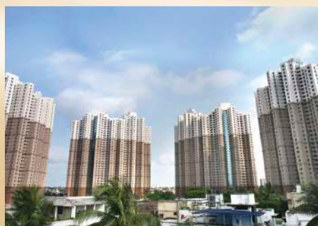
South City Residence | Kolkata