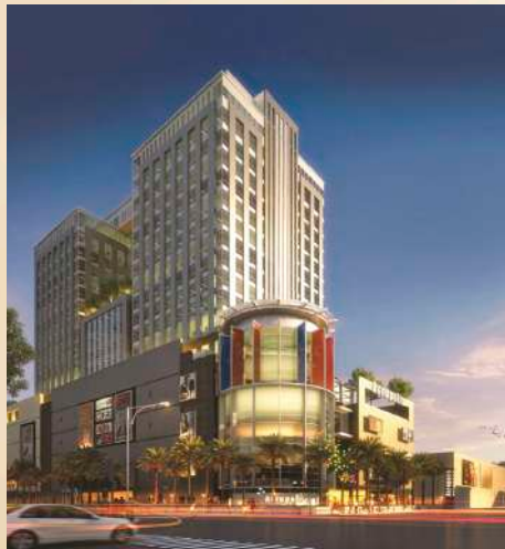
Acropolis Mall | Kolkata