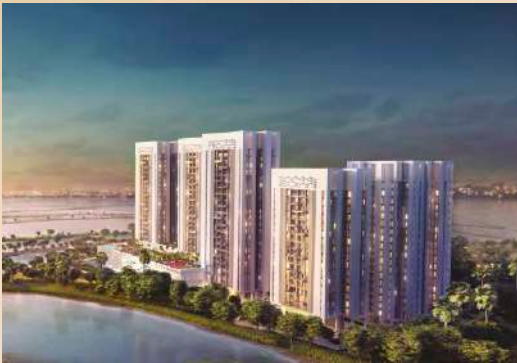
Fifth Avenue | Sector-V, Salt Lake