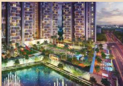
The One | Tollygunje, Kolkata