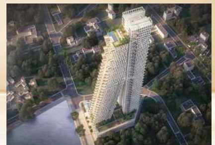
Altair | Colombo, Sri Lanka