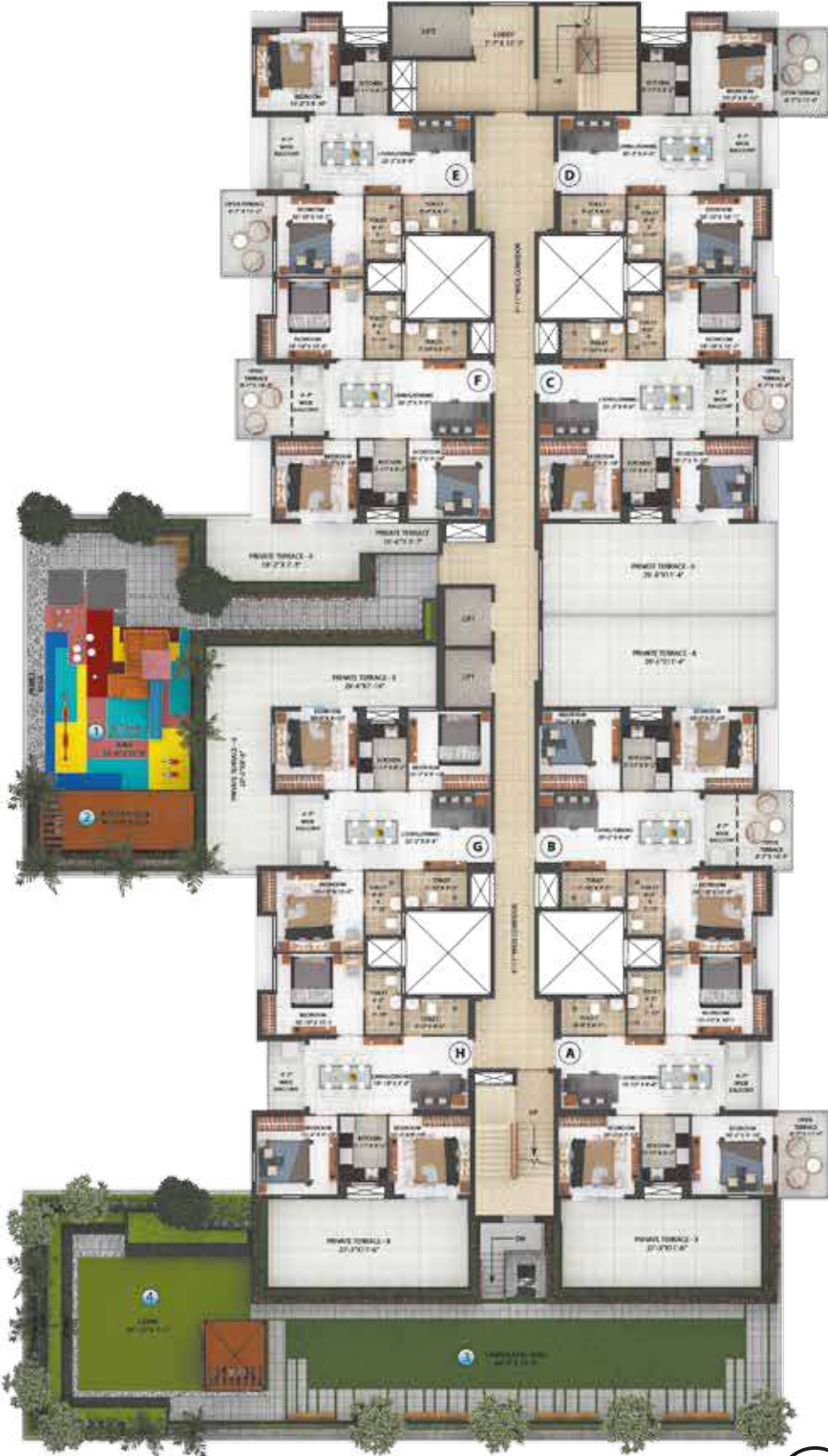
FLOOR PLAN | BLOCK 1 2ND FLOOR PLAN

*RERA Built Up area includes carpet area of the unit, cupboard, balcony & the wall area covering the unit, excluding open terrace BU area. The total chargeable area includes RERA Built Up area and 50% of the open terrace BU area. RERA carpet area excludes RERA cupboard carpet area. All RERA carpet area considered excluding finishes.