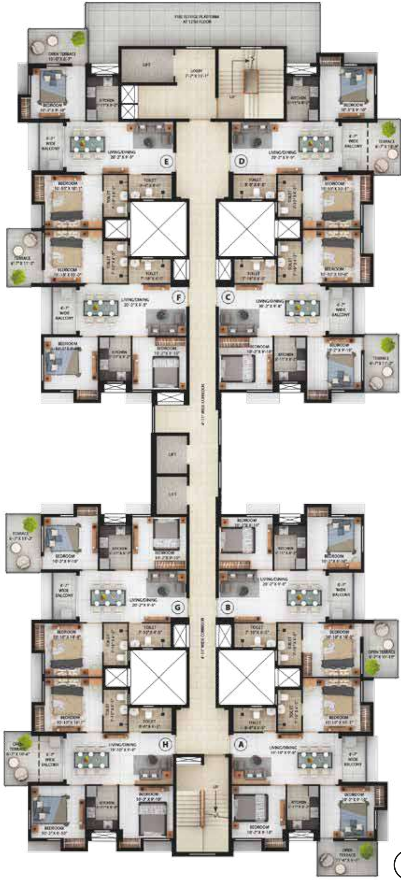
FLOOR PLAN | BLOCK-1: 3RD, 6TH, 9TH, 12TH, 15TH, 18TH, 21ST & 24TH FLOOR PLAN