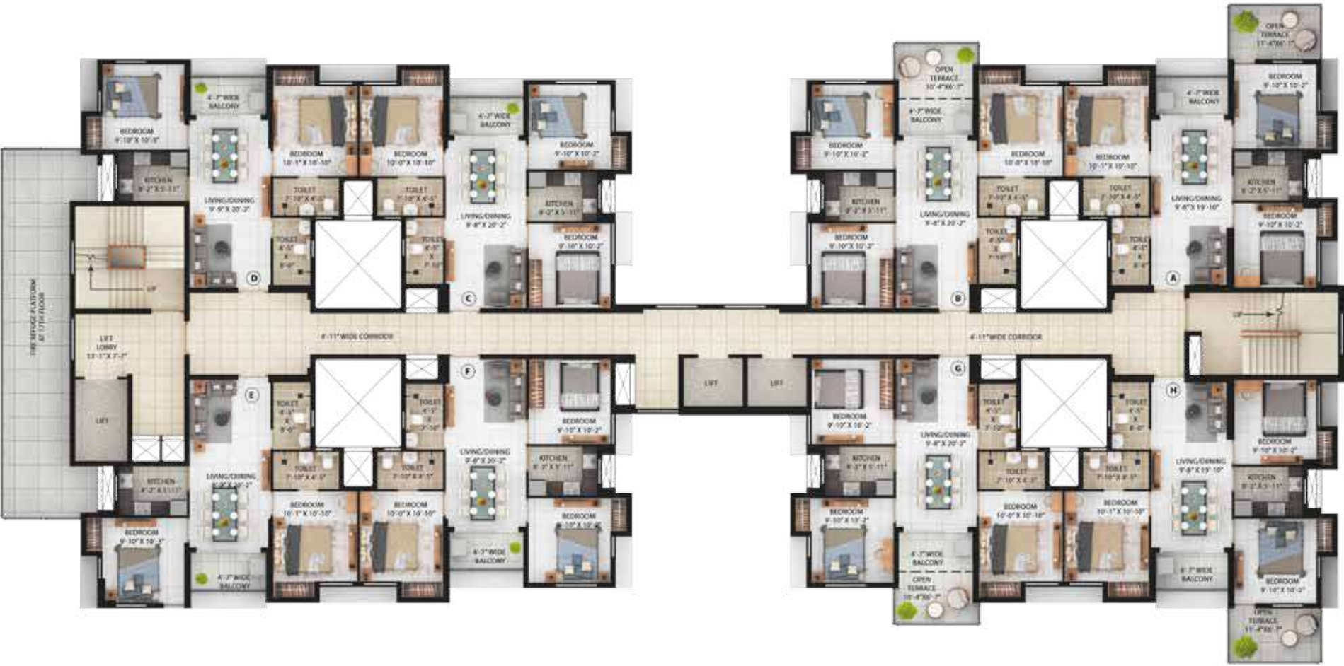
FLOOR PLAN | BLOCK-2: 2ND, 5TH, 8TH, 11TH, 14TH, 17TH, 20TH & 23RD FLOOR PLAN

Disclaimer : The dimension in the floor plans are shown as estimated. The dimensions which are shown in this brochure as well as in the sanction plan approved by the authorities are bare dimensions, as per architectural norms. It will reduce due to finishes such as plaster, POP, flooring etc.