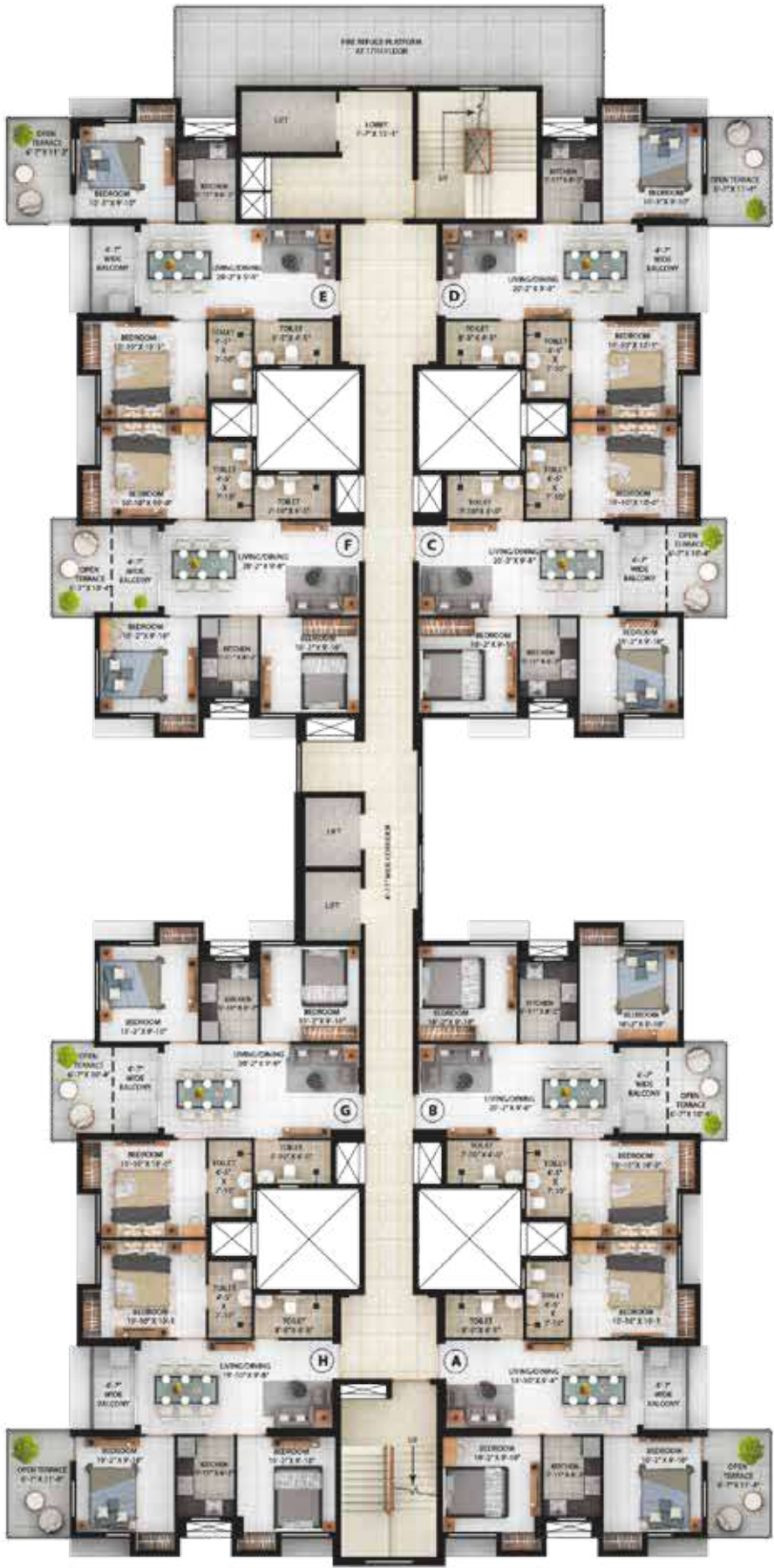
FLOOR PLAN | BLOCK-1: 5TH, 8TH, 11TH, 14TH, 17TH, 20TH & 23RD FLOOR PLAN