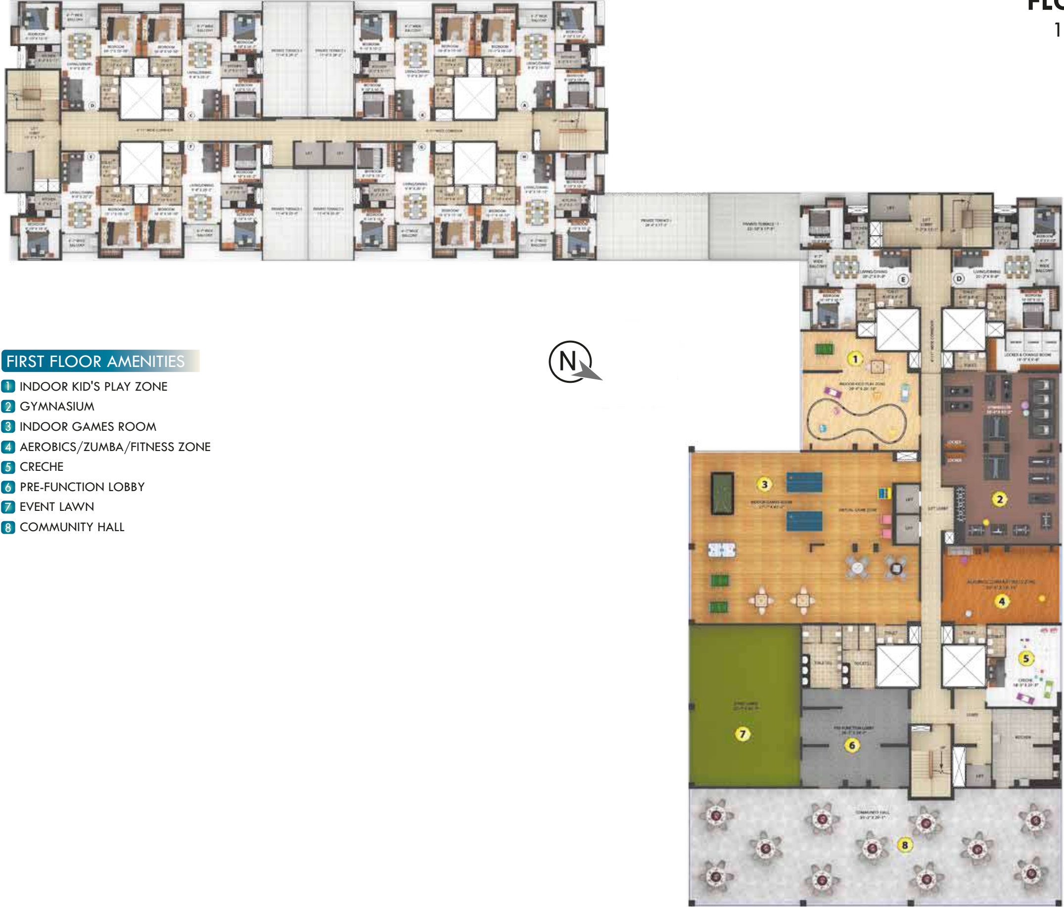
FLOOR PLAN | BLOCK 1 & 2 1ST FLOOR PLAN COMBINED