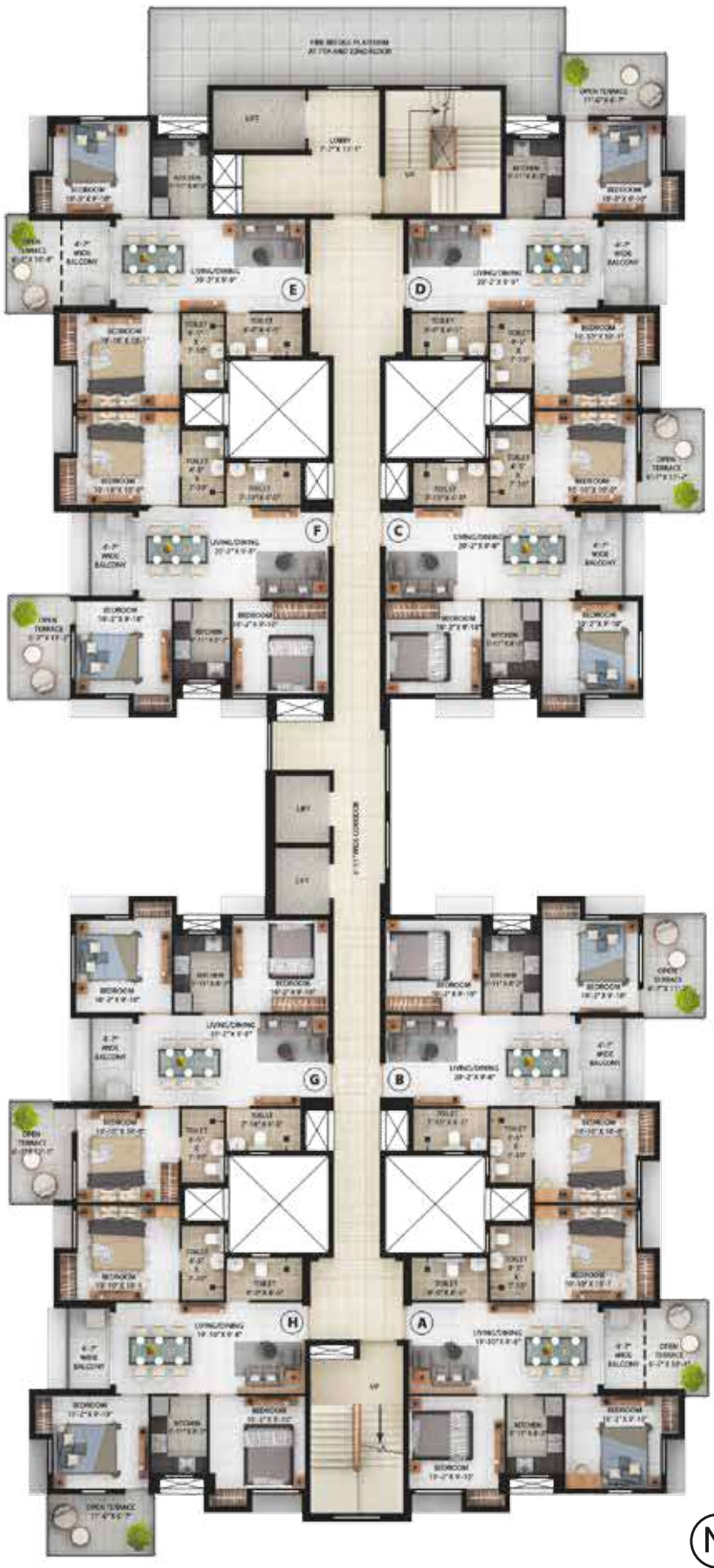
FLOOR PLAN | BLOCK-1: 4TH, 7TH, 10TH, 13TH, 16TH, 19TH & 22ND FLOOR PLAN

*RERA Built Up area includes carpet area of the unit, cupboard, balcony & the wall area covering the unit, excluding open terrace BU area. The total chargeable area includes RERA Built Up area and 50% of the open terrace BU area. RERA carpet area excludes RERA cupboard carpet area. All RERA carpet area considered excluding finishes.