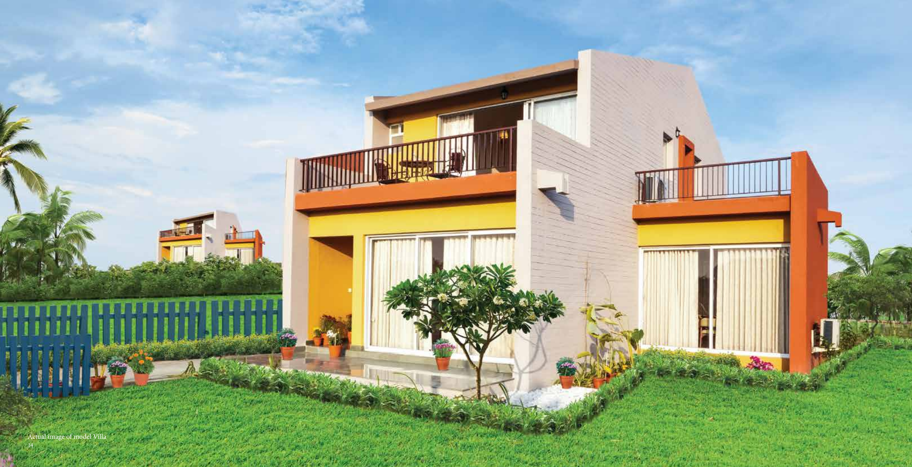
Actual image of model Villa