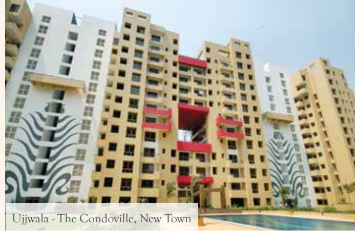
Ujjwala - The Condoville, New Town