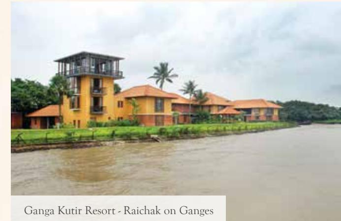
Ganga Kutir Resort - Raichak on Ganges