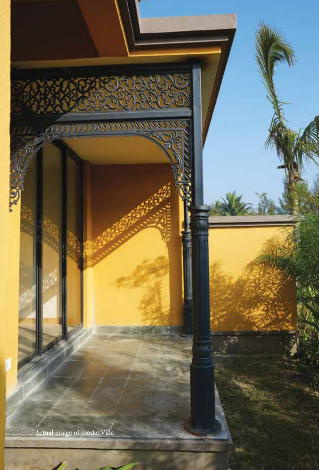
Actual image of model Villa