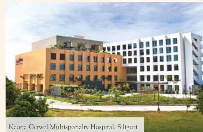
Neotia Getwel Multispecialty Hospital, Siliguri