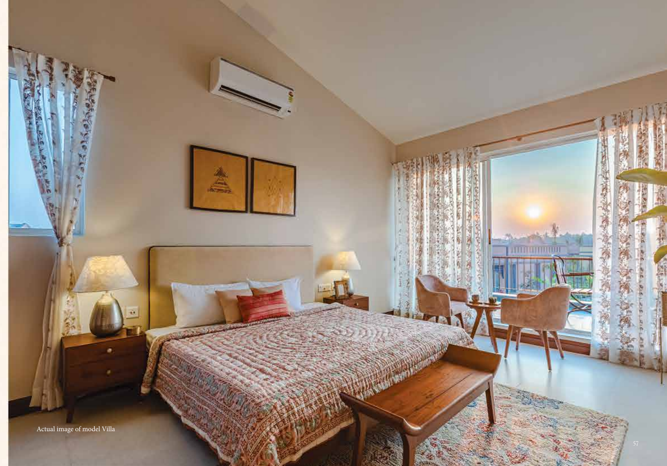
Actual image of model Villa

Bedrooms (Floor) - Vitrified Tiles Toilet's (Floor) - Vitrified Tiles Deck - Kota Stone & Paver Tiles Foundation - Strip Foundation / Isolated Super Structure - RCC Framed with Sloped Roof / load Bearing Living / Dining (Floor) - Vitrified Tiles Toilet/s (Dado) - Washable Paint & Glazed Ceramic Tile / vertified Kitchen (Counter) - Granite Kitchen (Dado) - Granite Tiles above the Counter Terrace (Floor) - Vertified/for Palmcove open terrace China Mosaic Verandah / Patio (Floor) - Vitrified Tiles Staircase (Floor) - Wooden finished at tread & Skarting, Riser's stone finish, for Palm Cove open stair Kota finish. Entrance Foyer (Floor) - Kota Stone Door/s (Frame) - Sal Wood Door/s (Paint) - Paint Finish over Wooden Doors Door/s (Shutter) - Flush Door Door/s (Fittings)- SS Finish Window (Frame)- Powder Coated Aluminium Glazed Window (Fittings) - Powder Coated / Tuffen Glass Paint (Internal) - Putty finish Paint (External) - Weather Coat / Texture Paint Electrical - Concealed Copper Wiring Plastic Modular Switches Water Supply - UPVC/CPVC Pipeline (Rainwater) - PVC (If Any) Pipeline (Soil Pipe) - Eco Drain Pipe Sanitaryware (Wash Basin & WO)- Jaguar or Equivalent Sanitaryware (Faucets)- Jaguar or Equivalent Sanitaryware (Showerhead)- Jaguar or Equivalent