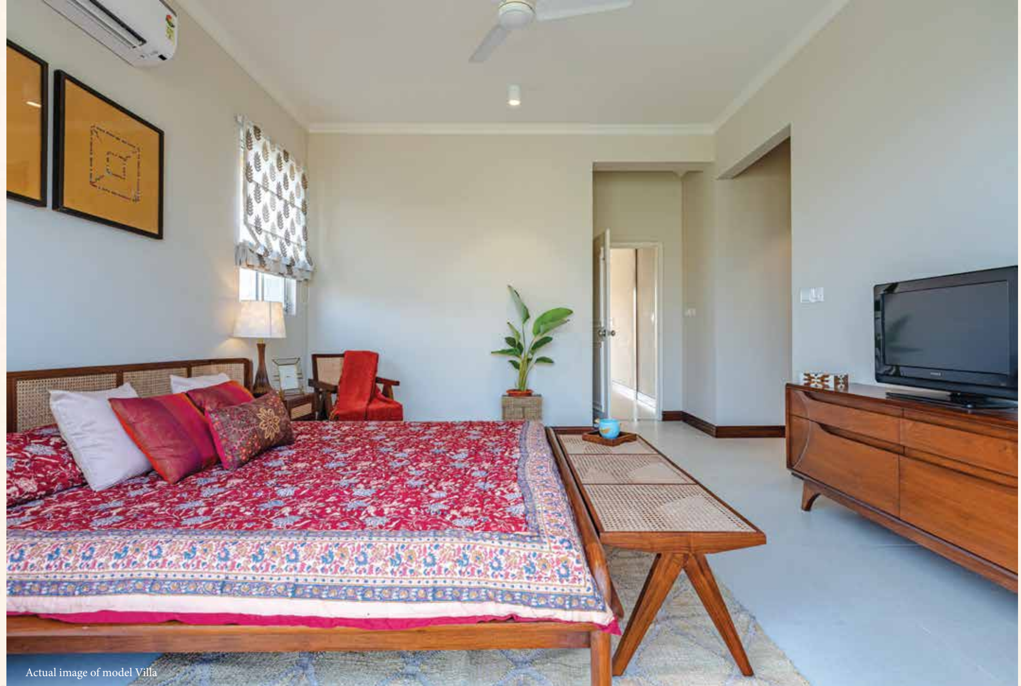
Actual image of model Villa