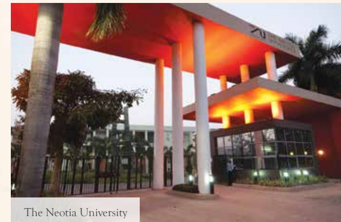
The Neotia University