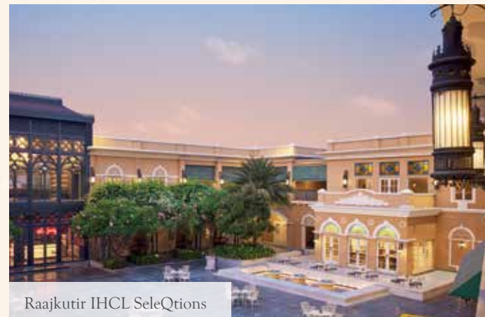
Raajkutir IHCL SeleQtions