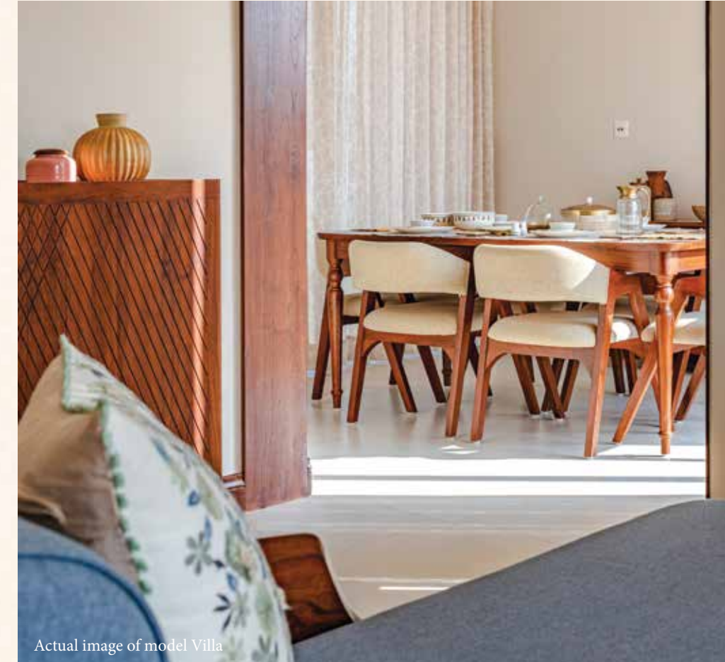
Actual image of model Villa