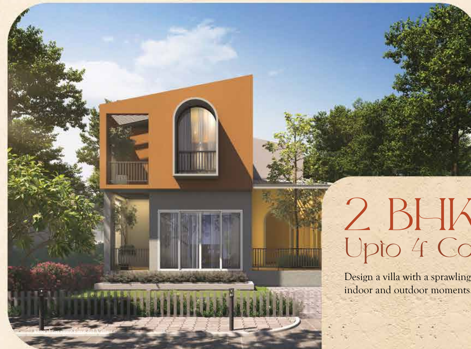
Actual image of model Villa