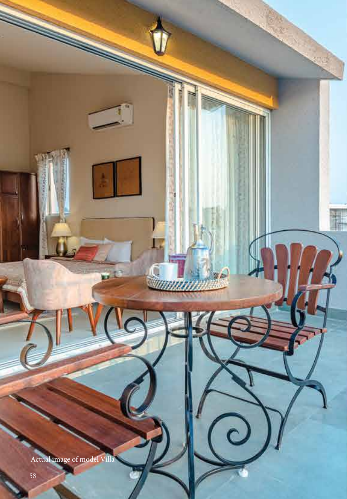
Actual image of model Villa