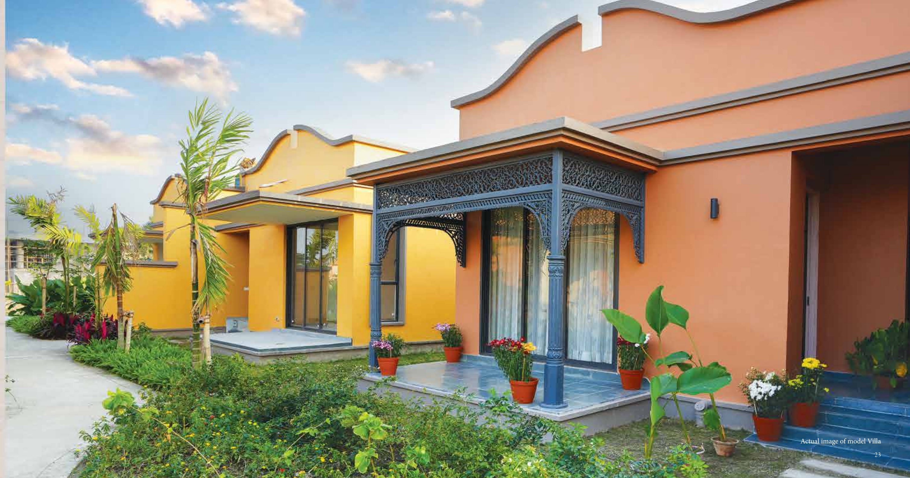
Actual image of model Villa

Nestled in lush greens, Palm Cove, part of Gardenia, unveils 40 exclusive 1BHK apartments with – an exclusive terrace. These compact villas cocooned amidst tall palms, lawns, orchards, and fountains create a haven for a happy community. Seamlessly blending living spaces, it fosters ideal gated community-living within nature's embrace. Star gaze, walk outdoors, nurture greens, read books, play games – be one with Nature at Palm Cove, your abode of happiness and wellness.