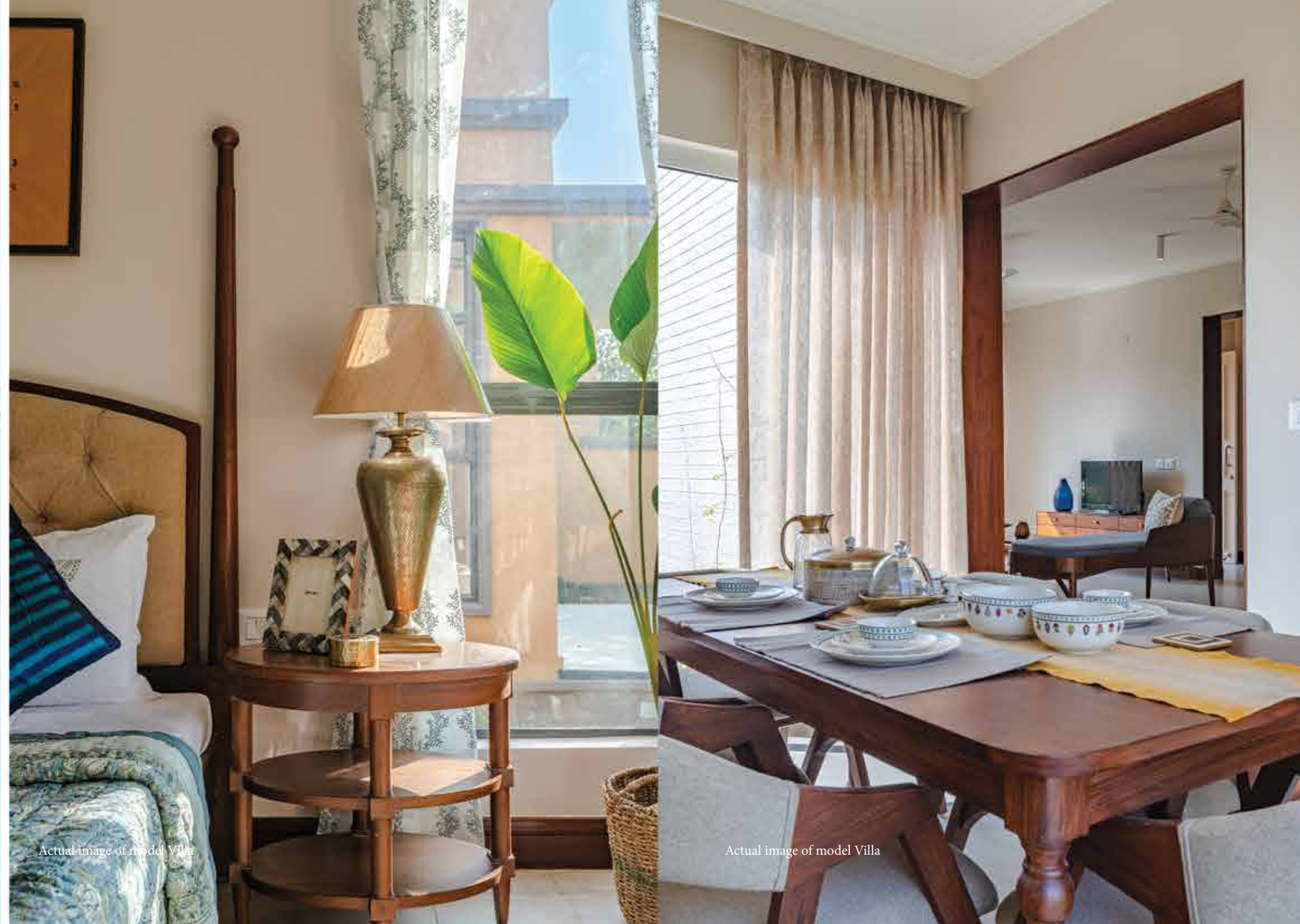
Actual image of model Villa