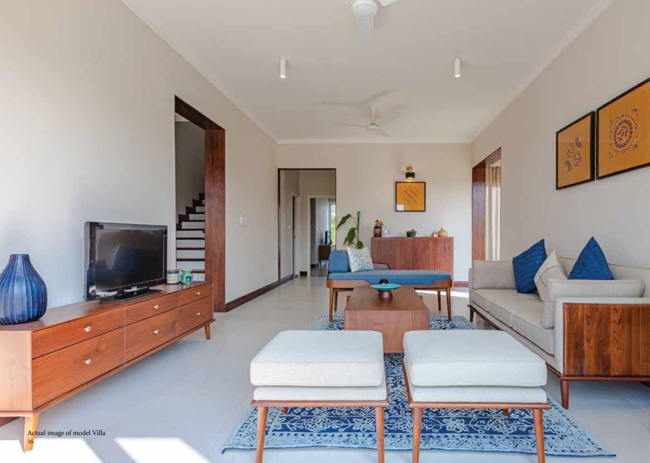
Actual image of model Villa