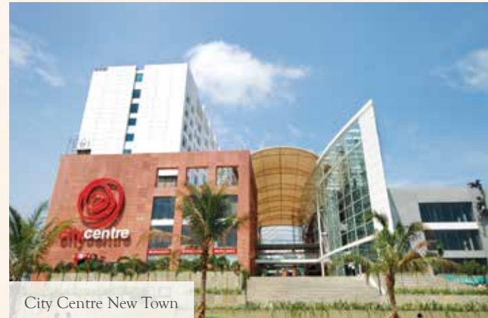
City Centre New Town