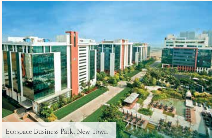
Ecospace Business Park, New Town