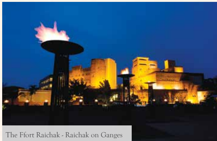
The Ffort Raichak - Raichak on Ganges