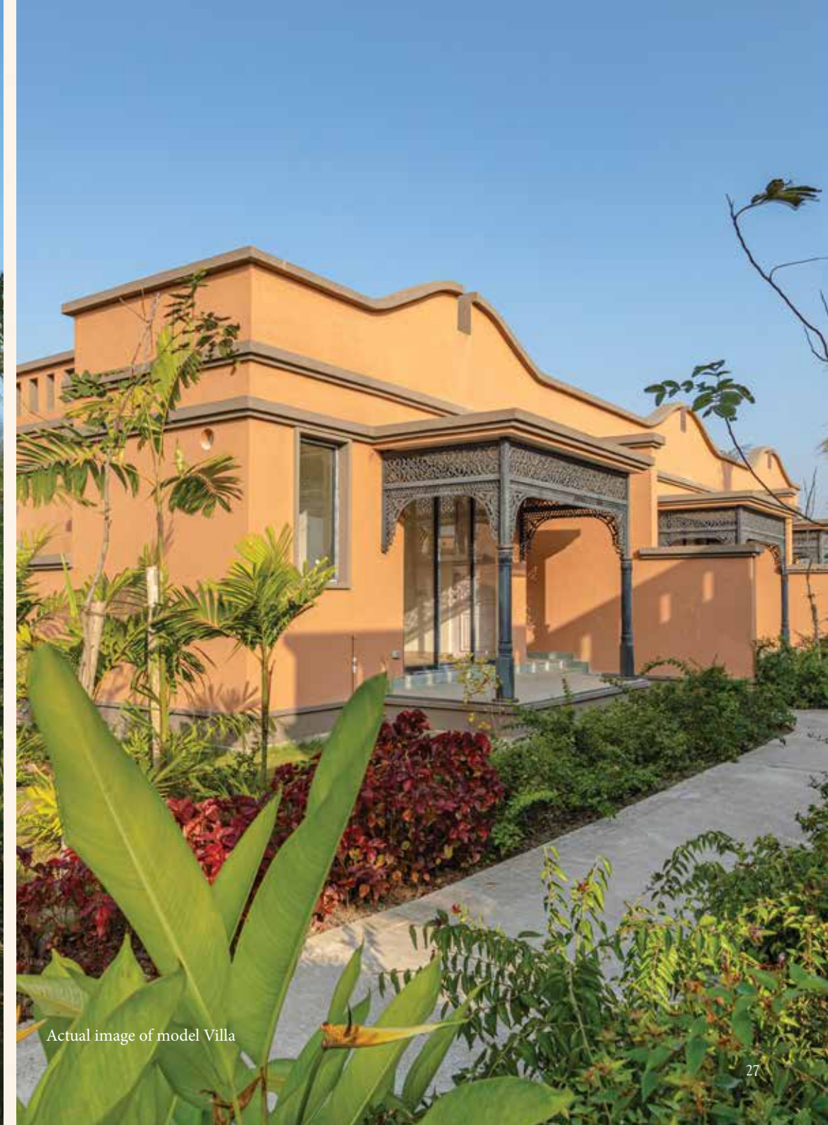
Actual image of model Villa