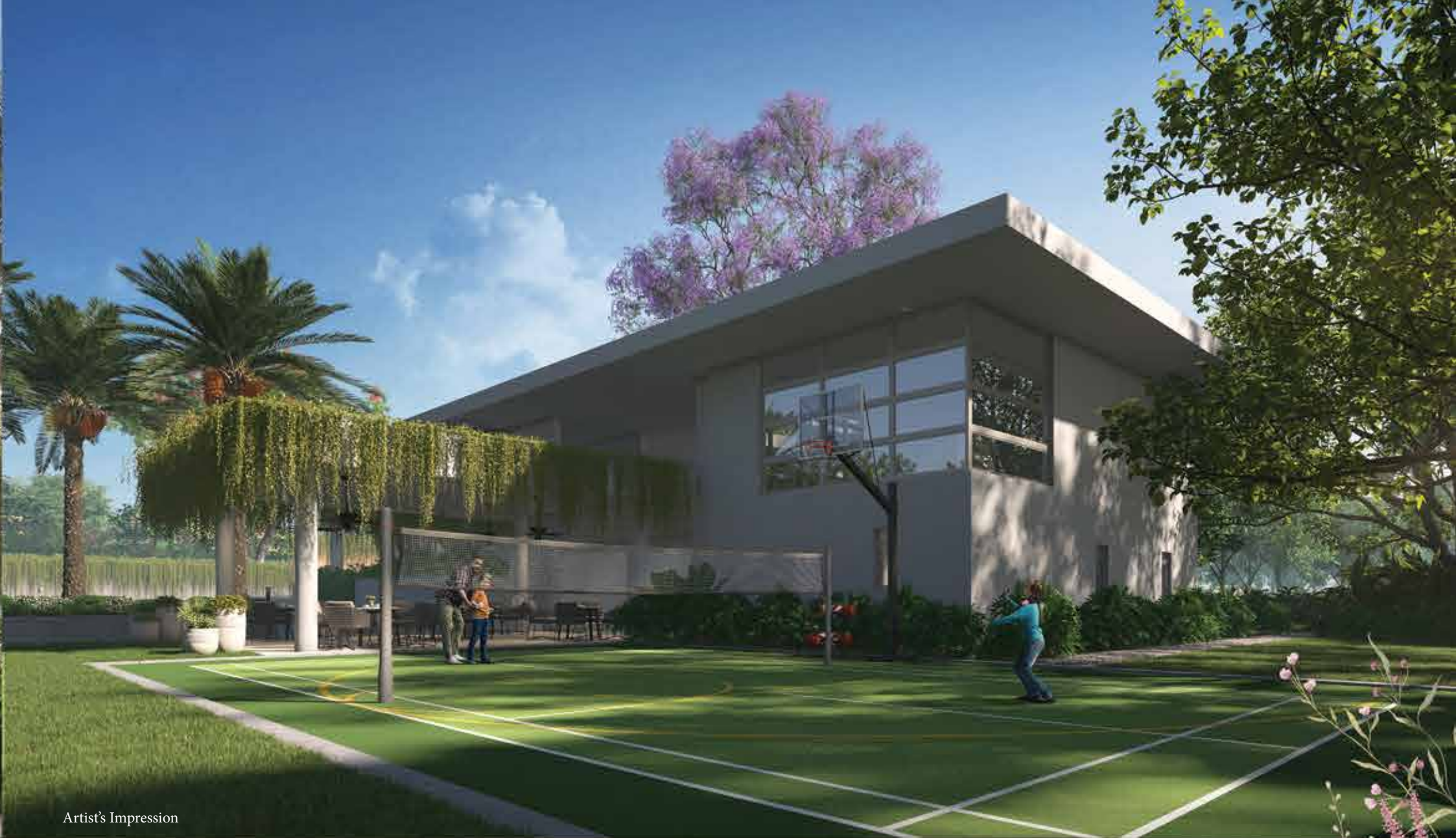
Kids' Play Area