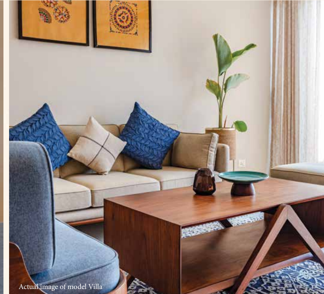
Actual image of model Villa