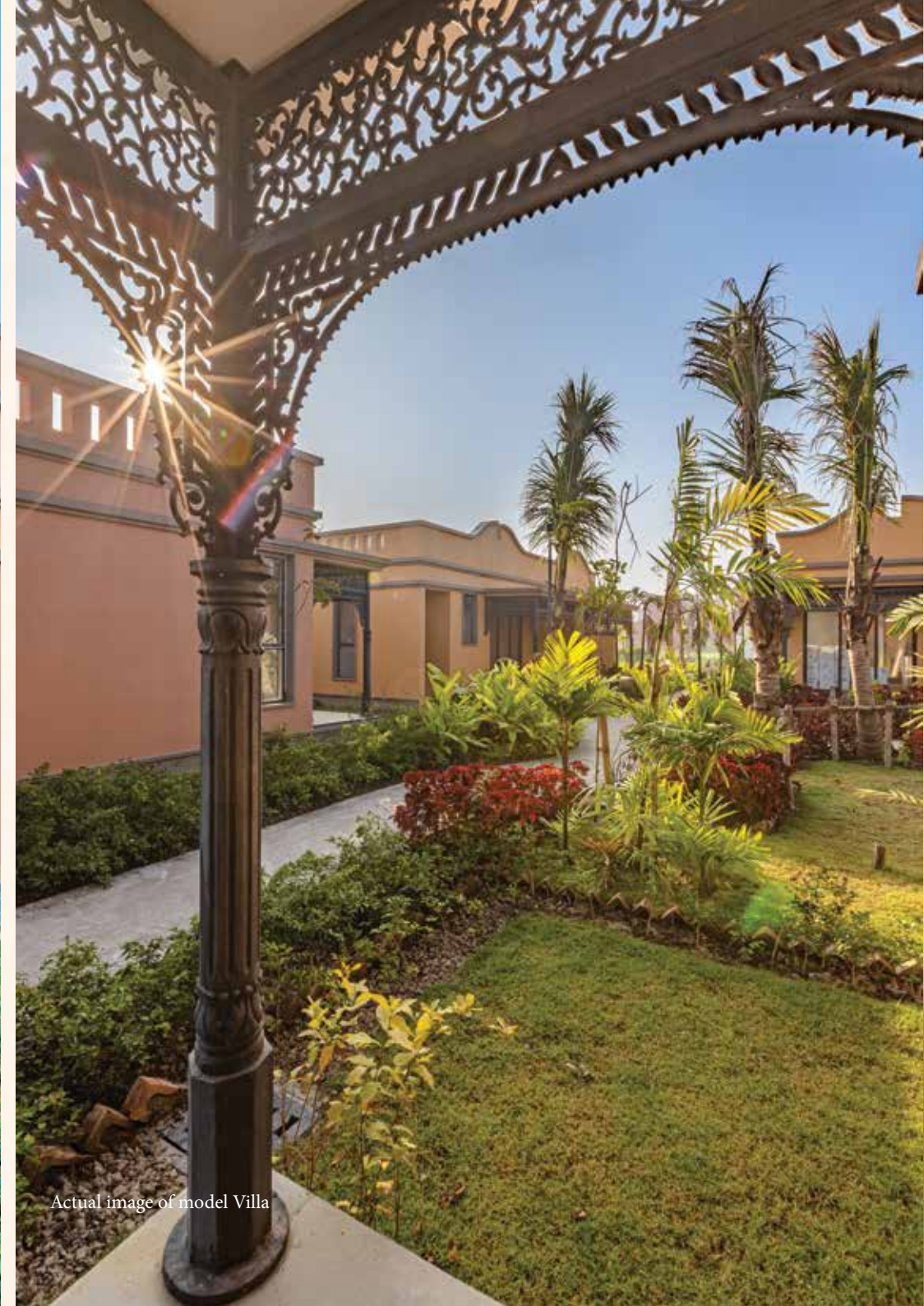
Actual image of model Villa