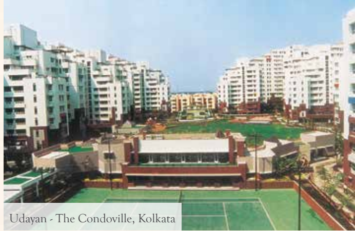
Udayan - The Condoville, Kolkata