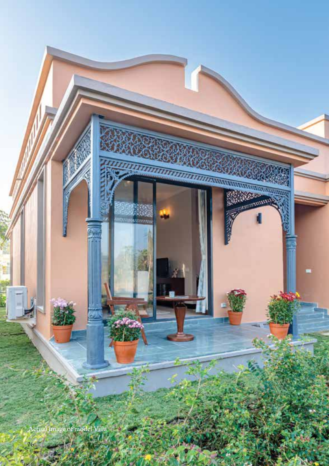
Actual image of model Villa