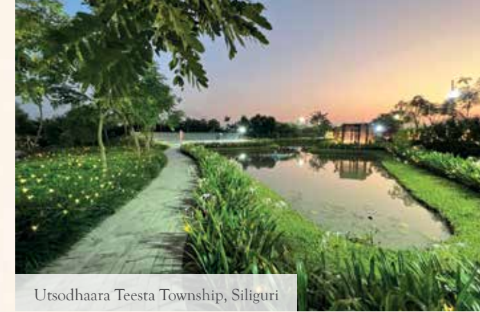
Utsodhaara Teesta Township, Siliguri