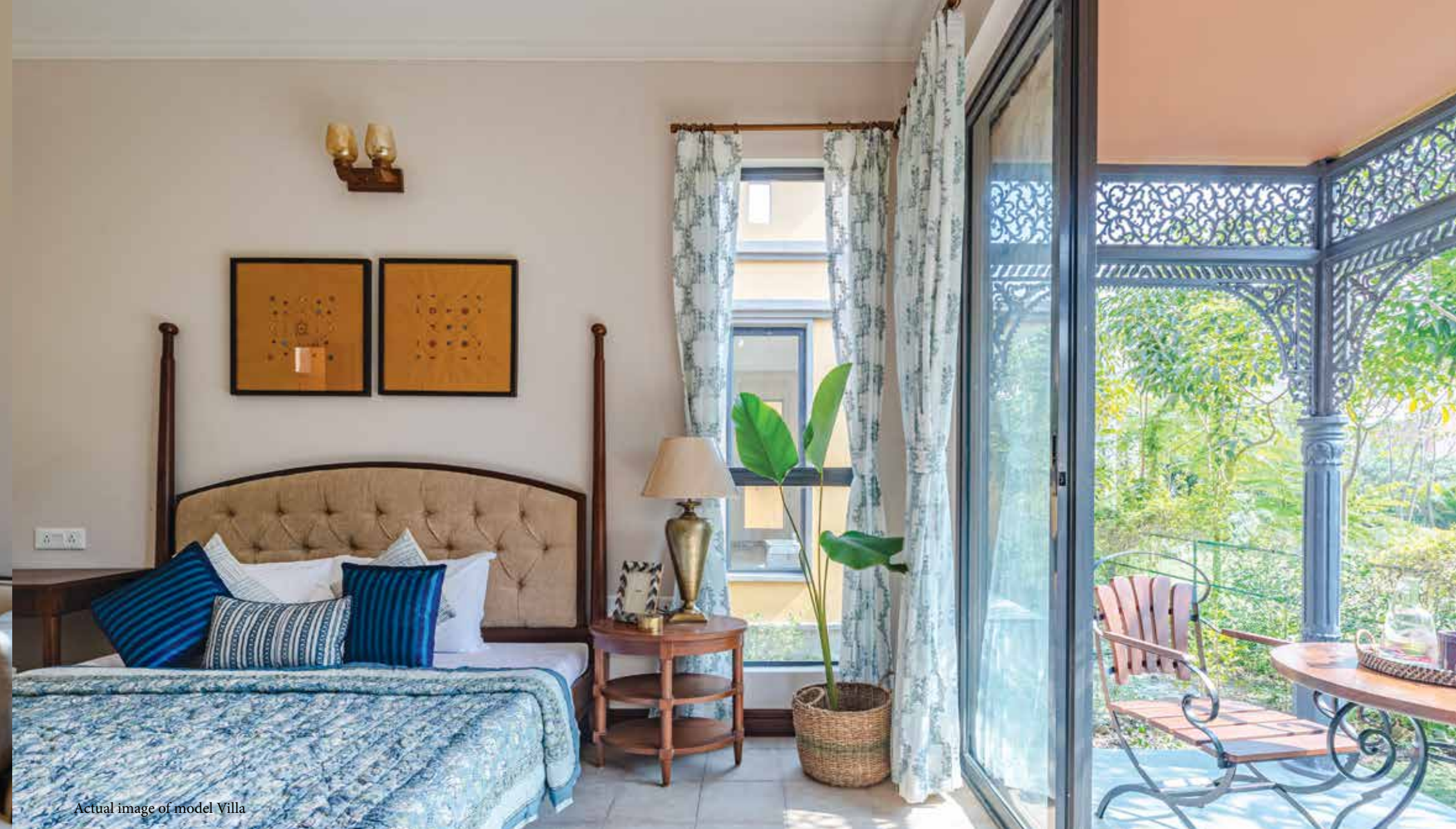
Bedroom with Open Deck