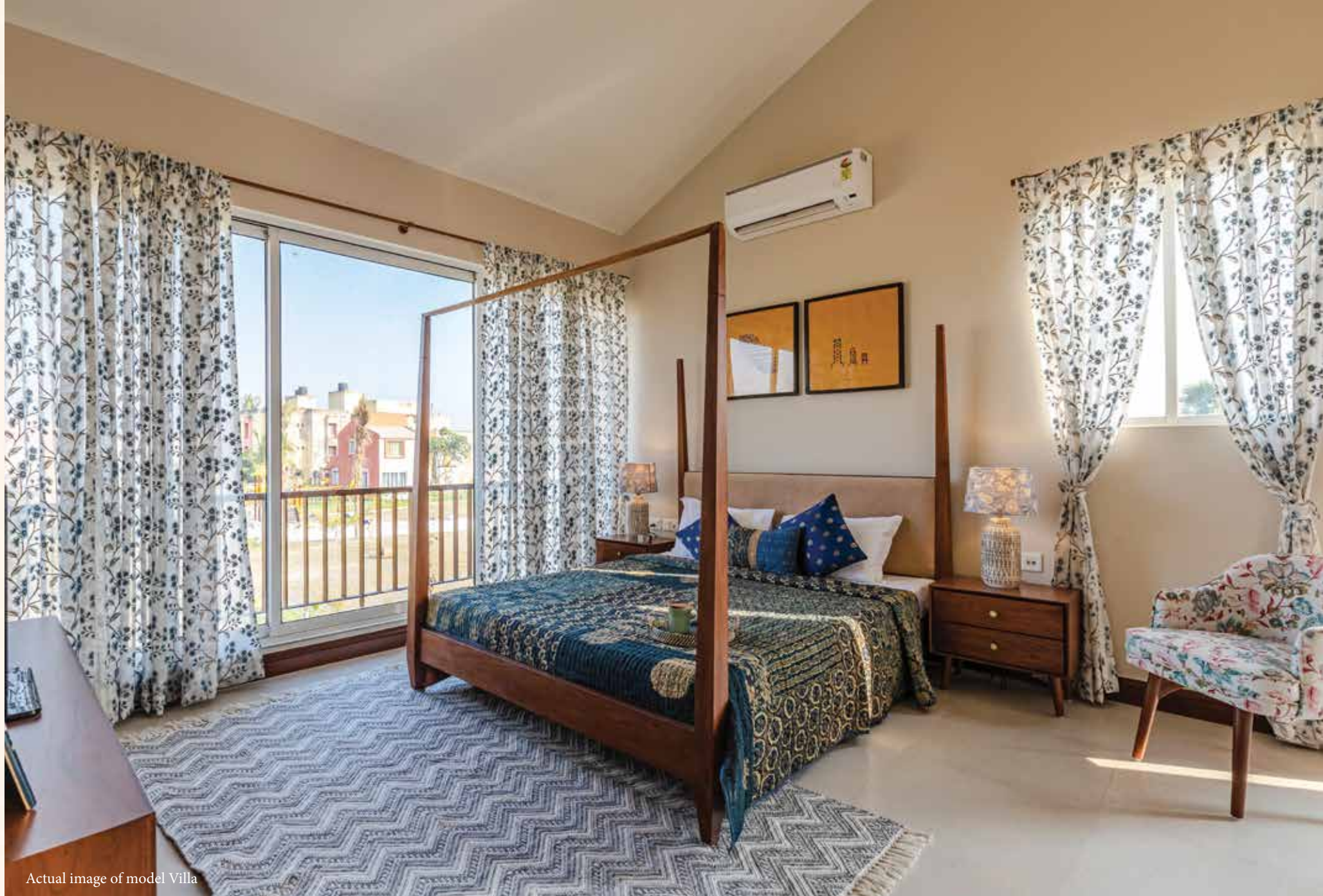
Actual image of model Villa