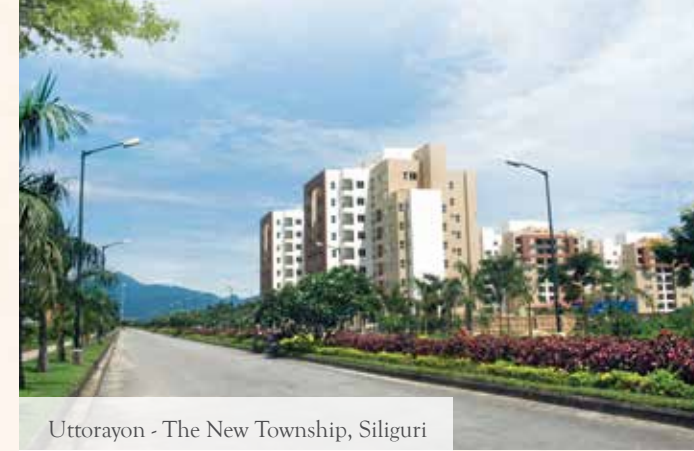
Uttorayon - The New Township, Siliguri