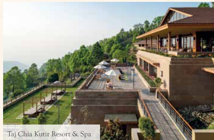
Taj Chia Kutir Resort & Spa