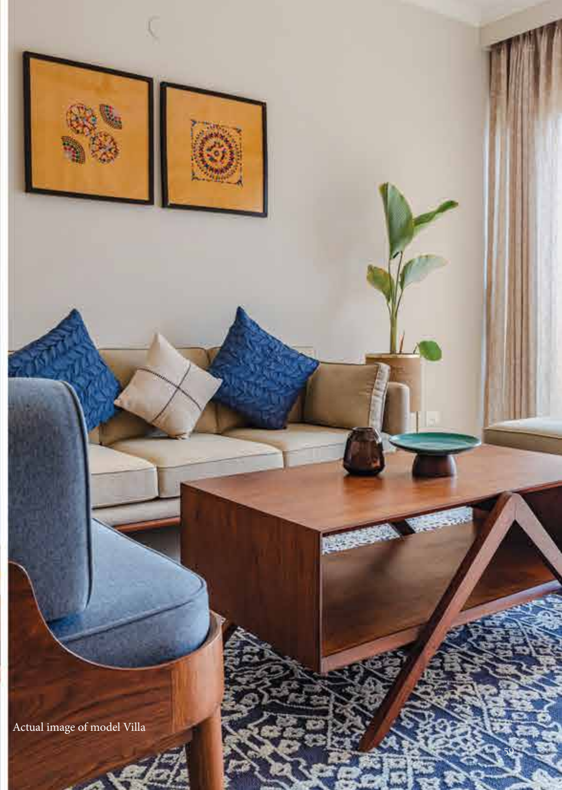
Actual image of model Villa