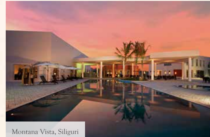
Montana Vista, Siliguri