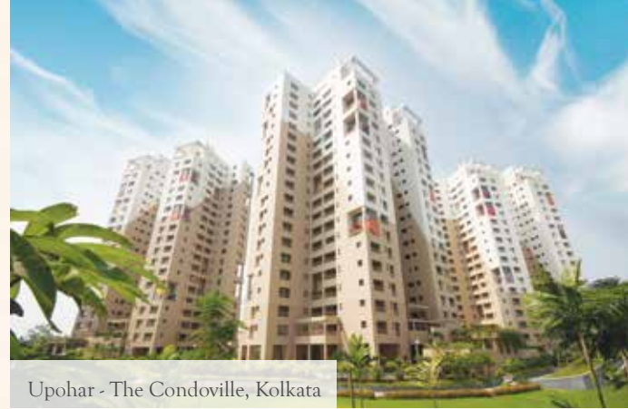
Upohar - The Condoville, Kolkata