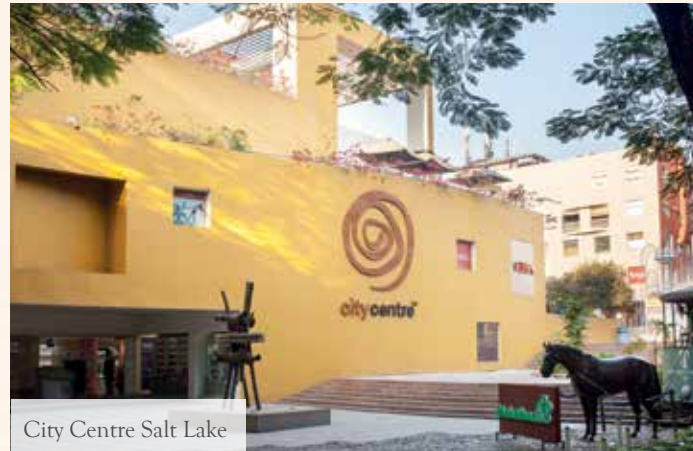
City Centre Salt Lake