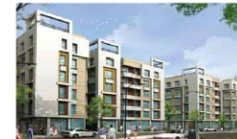
ARRJAVV GARDEN, RAJARHAT