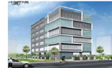
ARRJAVV PARK, SARAT BOSE ROAD