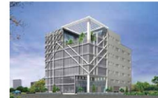
ARRJAVV SQUARE, ELLIOT ROAD