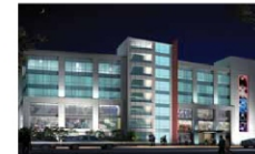
ARRJAVV BENCHMARK, TOPSIA