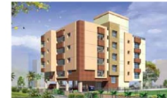
BALLYGUNGE CIRCULAR ROAD