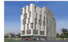
ARRJAVV CONNECT, RB CONNECTOR